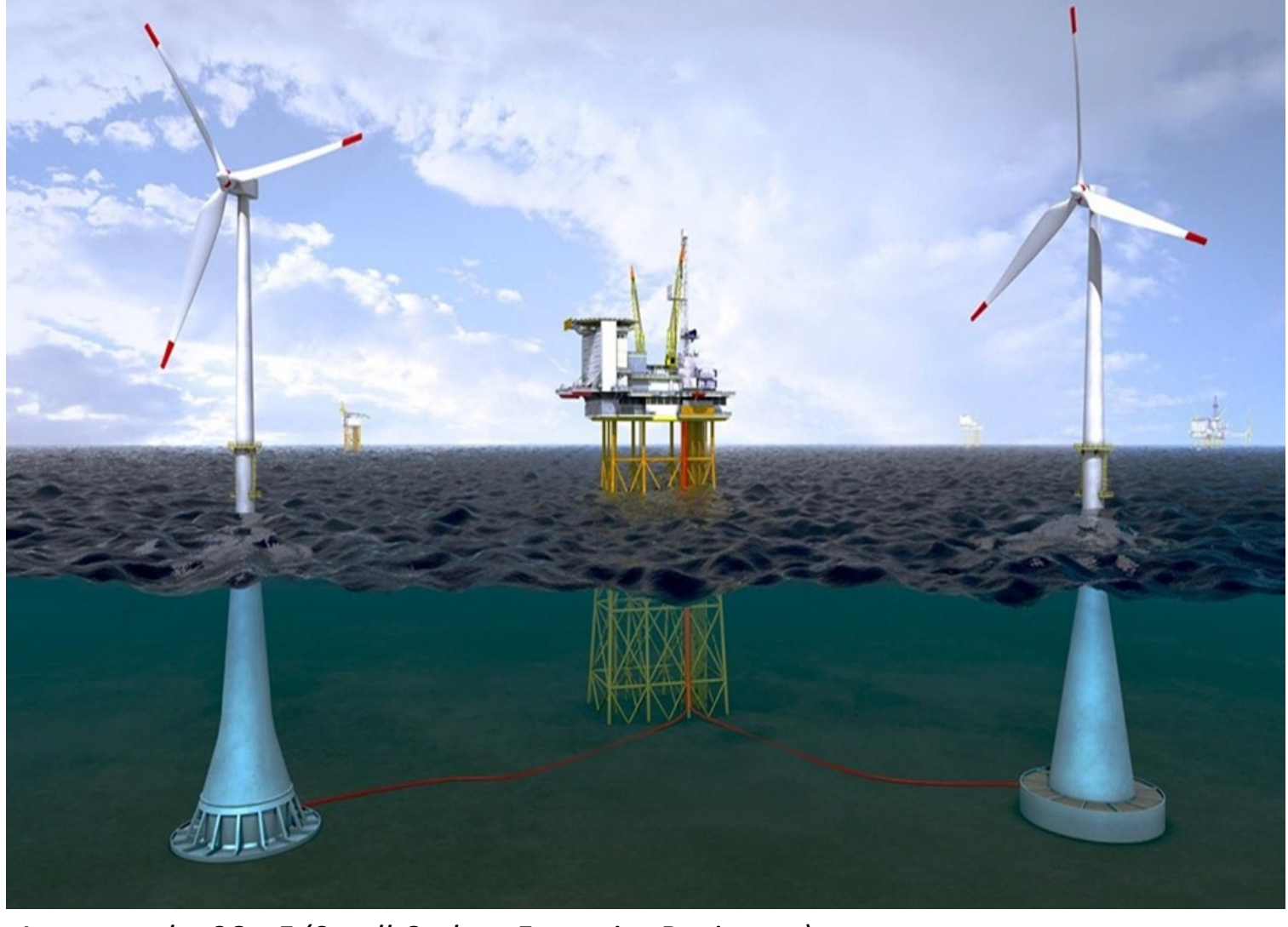
A concept by SCarF (Small Carbon Footprint Designers)